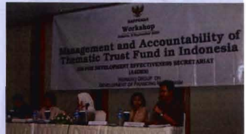
The speakers in the workshop Thematic Trust Fund in Jakarta, 9th September 2009.

common understanding on the use of trust fund a mean of funding government programs. It also discussed the administration mechanism as well as accountability issues. This workshop is the beginning of series of workshop under the WG on Development of Financing Mechanism.