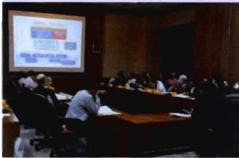
Meeting with 26 Development Partners discussing follow up support to the implementation of Jakarta Commitment through Transitional Multi Donor Fund (TMDF) mechanism.