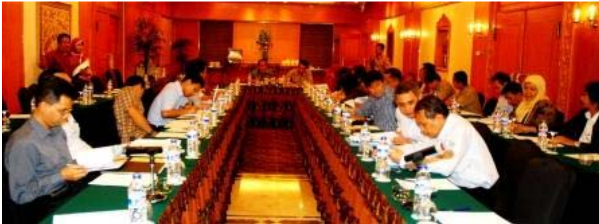
Participants of the Management Committee Meeting in serious discussion at Sultan Hotel, 21 October 2009.