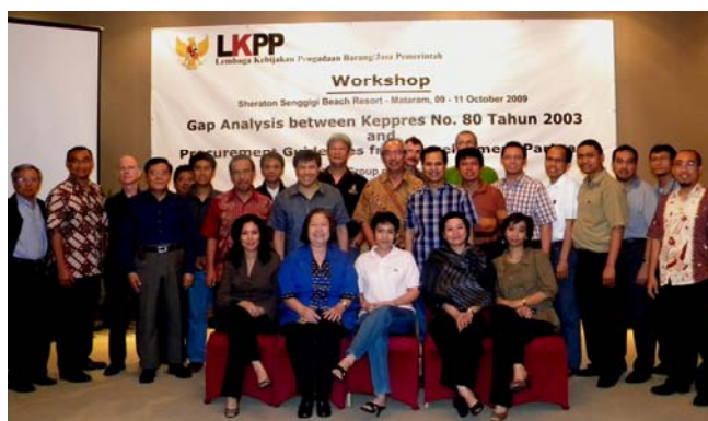
Working Group Procurement Team taking pictures to release stress after the workshop in Mataram, 9-11 Oktober 2009.